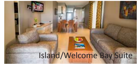
Island/Welcome Bay Suite